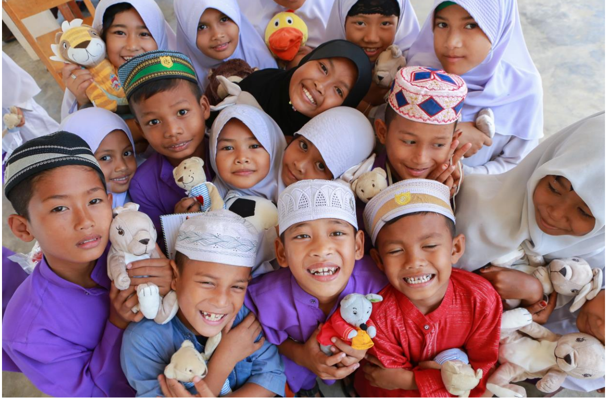
Children in the conflict-affected province of Pattani, in the Deep South of Thailand, enjoy stuffed toys donated by IKEA